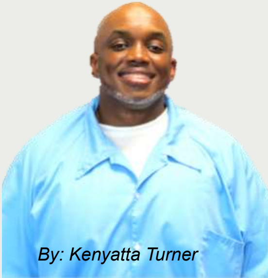
By: Kenyatta Turner