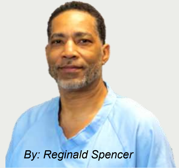
By: Reginald Spencer

The African Hebrew Israelites classes here at KLSRC is peer-led and we believe and teach that the Bible is to be accepted as an inherent and infallible, historical and spiritual document. We're willing to extend the hand of Brotherhood to all wanting to express Righteous/Positive behavior and conduct and promote the unification in principle and truth of everyone, regardless of race, religion, creed or color.