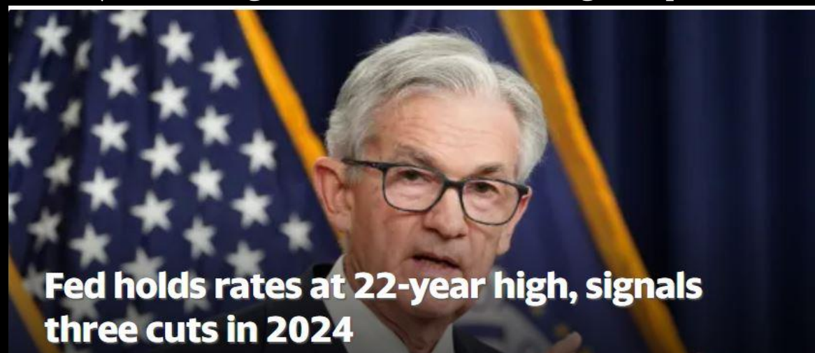
Fed holds rates at 22-year high, signals three cuts in 2024

So, the market has taken matters into its own hands. With the economy in shambles (the FED, inflation and the price of goods) the market is showing that if rates are not cut, that the consumer will lead the strike. As of August 1st, Jerome Powell decided that it would be best that the FED would apply a rate cut in the September meeting. He never shows his hand as to the amount, but the market responded, in-kind. The last two days of that trading week (August 2nd and 3rd), the Dow, S &P and NASDAQ tanked to the tune of 2%, 1.9% and 3.4%, respectively. This led to major selloffs in all industries, but none like that in the Tech sector. NVDA, TSLA, AAPL, AMZN and others fell sharply to lows that many haven't seen. AMAZN fell from near $190 to $165 (down 13%). NVDA also took a nose dive (in the sector, of course) by shedding from its $120 high to a low of $92 (on the bright side, that is nothing compared to its' 250% gain in the last year and a half!). Let's be clear, the market has been pretty damn good over the last year and a half, especially when the National Bureau of Economic Research (NBER) "changed" the definition of RECESSION. So, many people headed for the hills and were selling