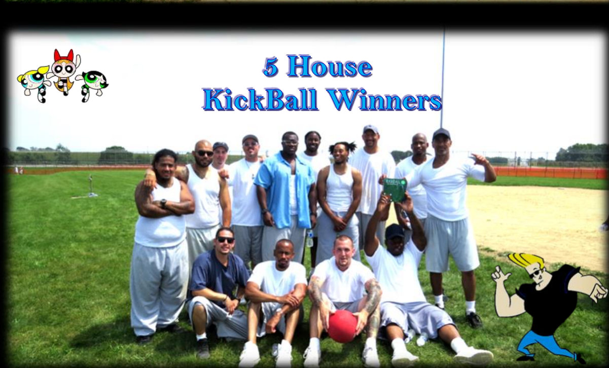
5 House KickBall Winners